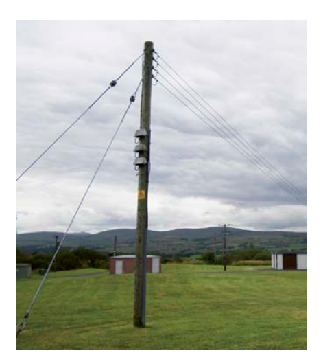
Figure 3 400 V distribution line