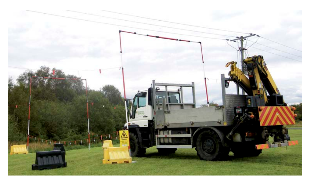
Figure 5 Typical passageway through barriers