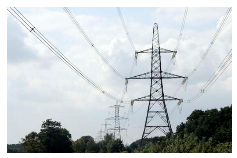
Figure 1 275 kV transmission line

6 Most overhead lines have wires supported on metal towers/pylons or wooden poles – they are often called 'transmission lines' or 'distribution lines'. Some examples are shown in Figures 1–3.