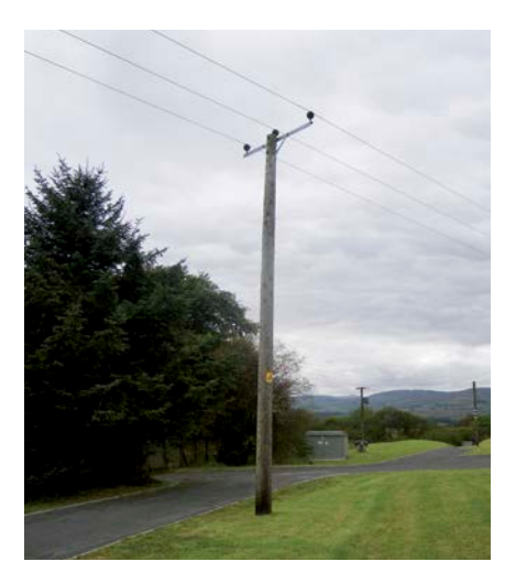
Figure 2 11 kV distribution line